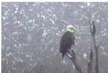
A Bald Eagle Stands Guard Above the OKK Campfire Ring