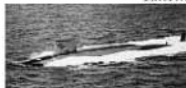
USS Thomas A. Edison SSBN 610