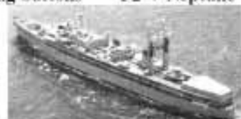
USS Howard W. Gilmore AS-16 Submarine Tender