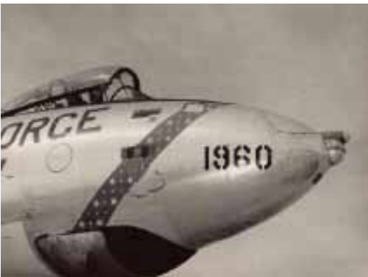
Poncho waving Bye Bye