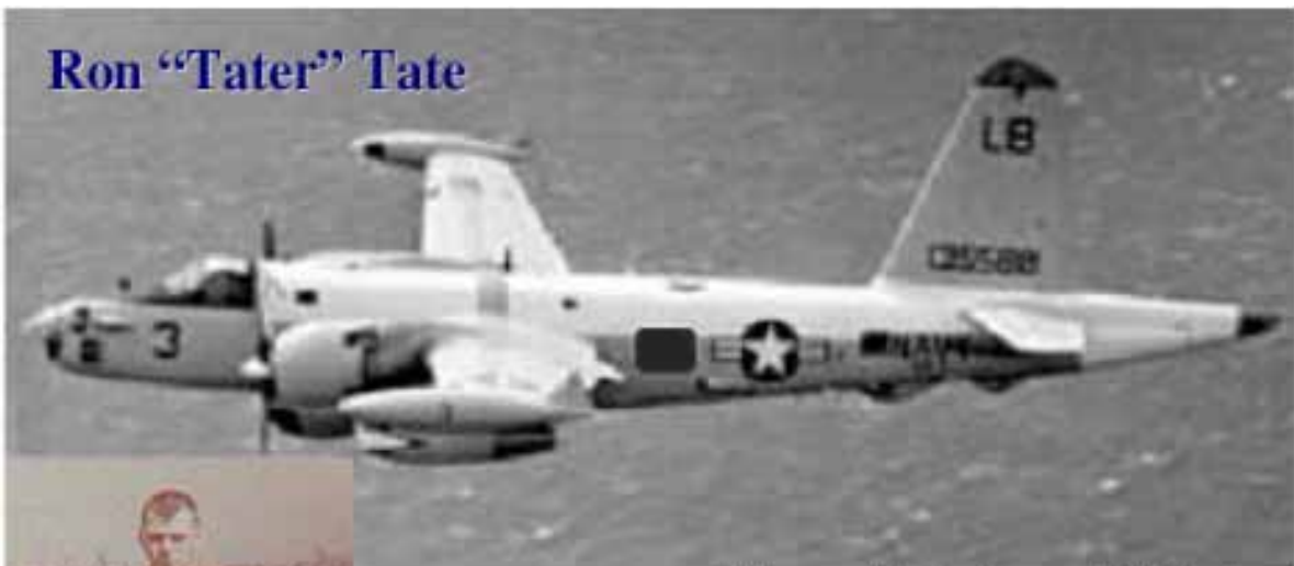
Tater... pushing buttons P2-V Neptune