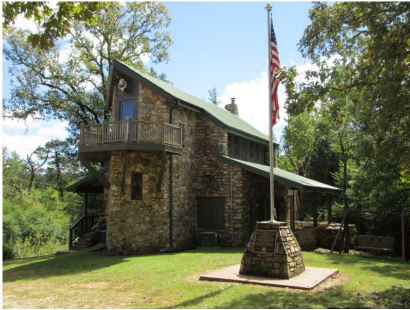
Restored Thunderbird Lodge