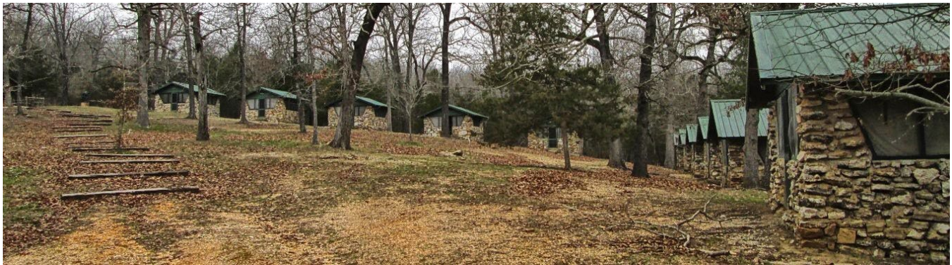
Native Stone and Wood Cabins