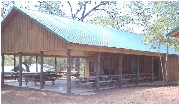
Dining Pavilion with Kitchen and Cooking facilities