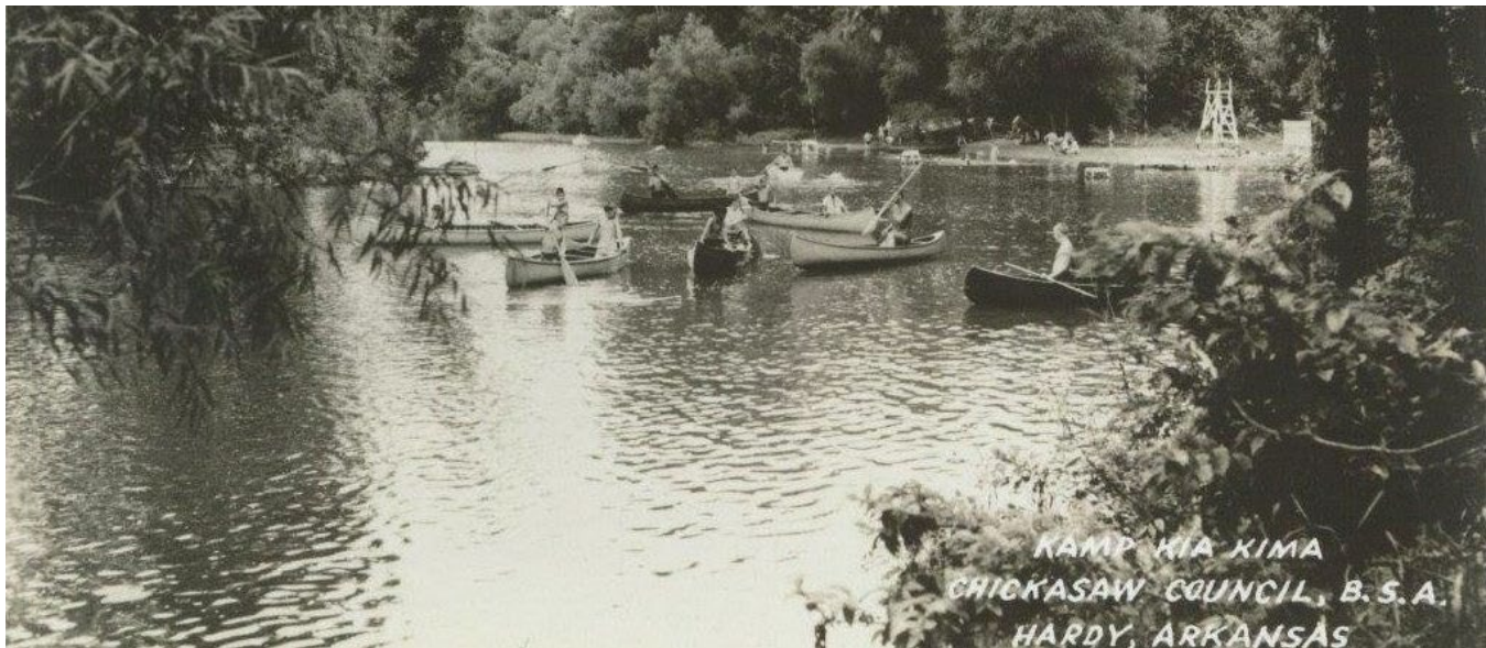
1958 Waterfront on the South Fork of the Spring River

The camp is situated on a bluff overlooking a pristine riverfront on the South Fork of the Spring River in Sharp County, Arkansas. The name chosen for the Scout camp was "Kia Kima" which in the Chickasaw Indian native language, means "Nest of the Eagles".